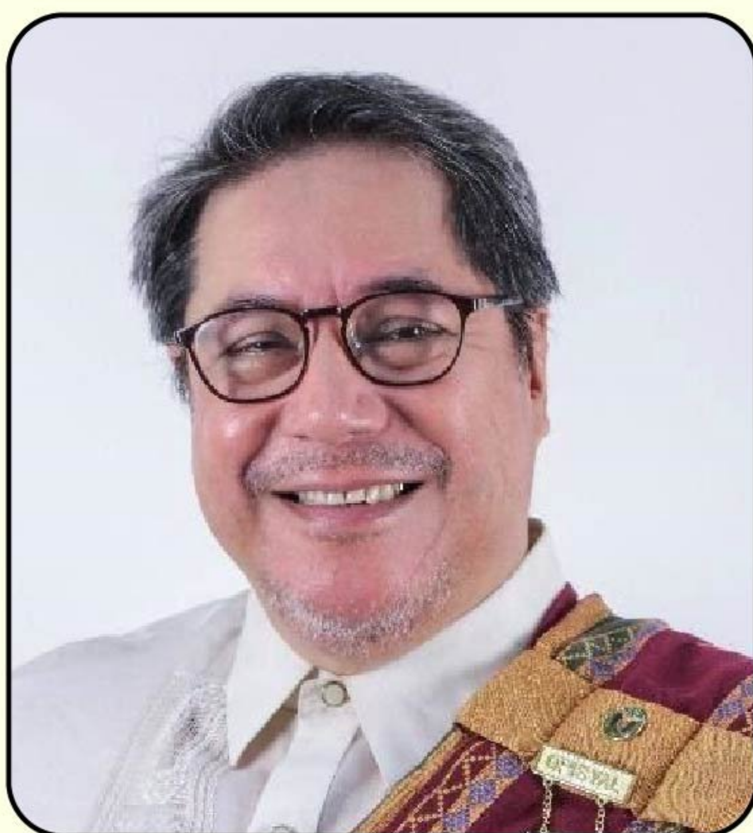
Hon'ble Teodoro J. Herbosa

Hon'ble Teodoro J. Herbosa (MD, FPCS, FPCEP-PCEM), Secretary of Health, Department of Health, Manila, Philippines