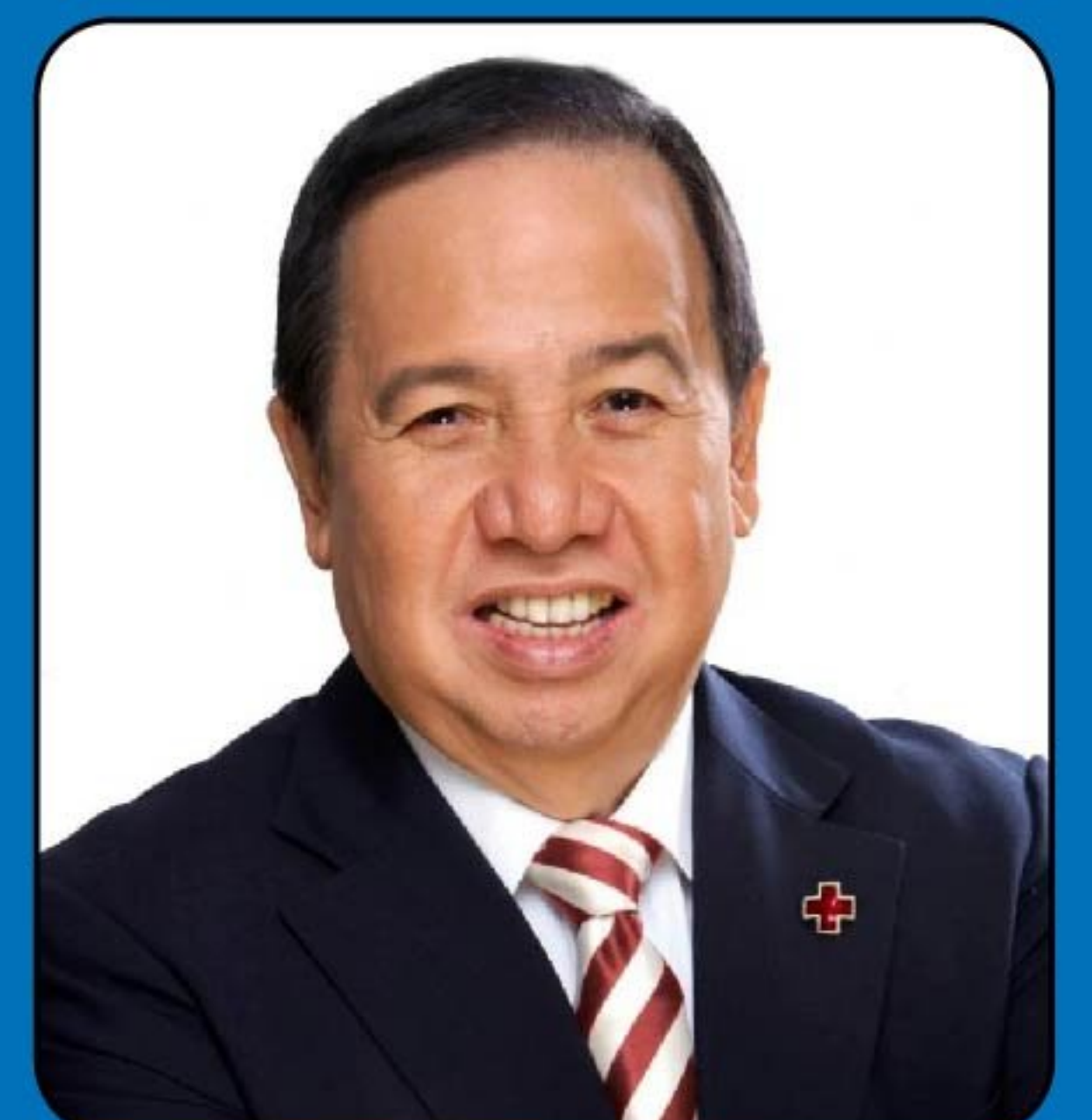
Senator Richard J. Gordon

Director General, Food and Drug Administration, Philippines